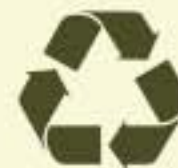
XX% total recycled fiber

Products or packages made with less than 100% recycled fiber should use the recycling symbol as shown below. The symbol should be accompanied by a legend identifying the total percent (by weight) of recycled fiber. An appropriate legend might read “XX% total recycled fiber.” 3