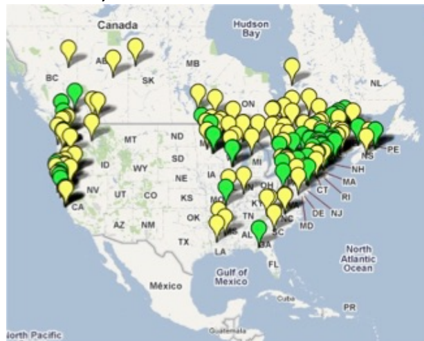
Figure 3. FSC Forest Management and Group Certificates, 2010